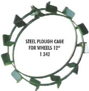
STEEL PLOUGH CAGE FOR WHEELS 12" 1 342