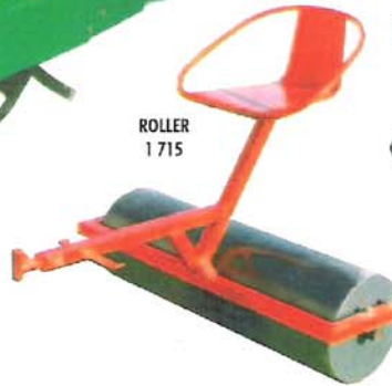
ROLLER 1 715