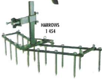
HARROWS 1 454