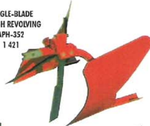
SINGLE-BLADE PLOUGH REVOLVING APH-352 1 421