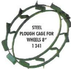
STEEL PLOUGH CAGE FOR WHEELS 8" 1 341