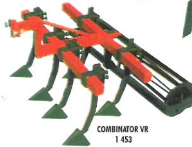
COMBINATOR VR 1 453