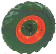
8" WHEELS 1 310 4698