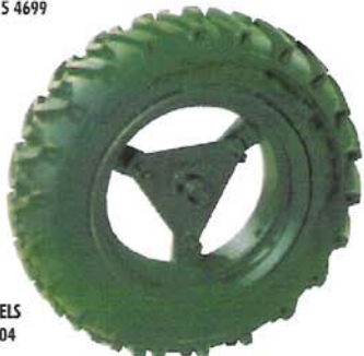
14" WHEELS 1 320 4804