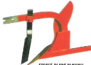
SINGLE-BLADE PLOUGH API-018 1 411