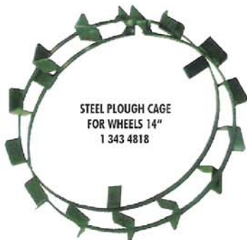
STEEL PLOUGH CAGE FOR WHEELS 14" 1 343 4818