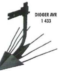
DIGGER AVR 1 433