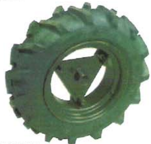
12" WHEELS 1 315 4699