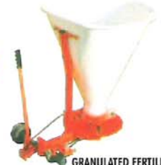
GRANULATED FERTILIZER SPREADER (AD QUATRO) 1 713 0010