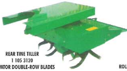
REAR TINE TILLER 1 105 3120 CULTIVATOR DOUBLE-ROW BLADES 1 351 4677