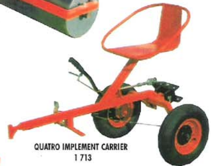
QUATRO IMPLEMENT CARRIER 1 713